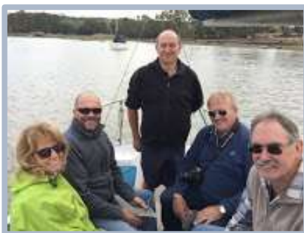
1. Happy Members enjoying another transport mode

Closing date 20 October – winners to be announced at the Christmas weekend.