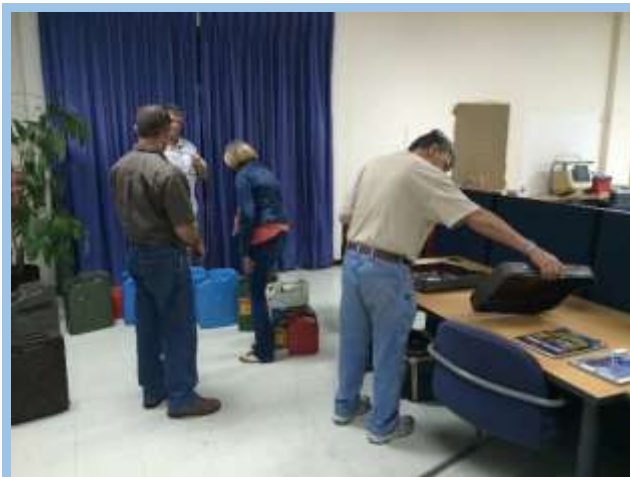
Jerry Cans on display attract much interest