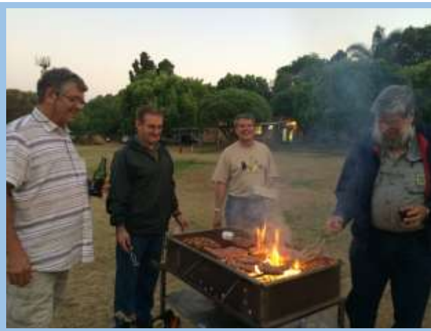
Die-hards around the braai