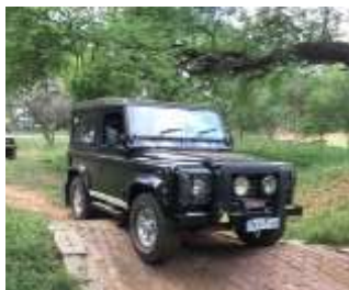
Laetitia conquering the axle twister

On Saturday morning 21 January we completed our first driver training session for the year ie. Module 1: Fundamentals of off-road driving at the Rust de Winter off-road track north of Pretoria. Training commenced at about 09h00 and in total there were 11 vehicles and 16 trainees in attendance who were eager to improve their general off-roading skills and explore the capabilities of their vehicles – 4 were Defenders and the balance were a combination of Disco 1's to 4's. This module was presented by myself and Jakob Jordaan which started out with some theoretical training in the morning and ended with lots of practical driving later in the afternoon. Rust de Winter offers a large variety of off-road obstacles from axle twisters to side