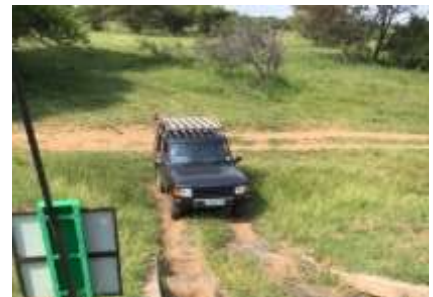
Eric tackling a steep incline

slopes which made for very exciting training. The day ended at about 16h00 after the assessment and all attendees received their LROC attendance Certificates. Many thanks to those that attended and especially to Jakob for his assistance with presenting this module. As a side note, three of the trainees participated in the summer trial on Sunday - well done to them for completing Module 2: Participation in Trials the next day.