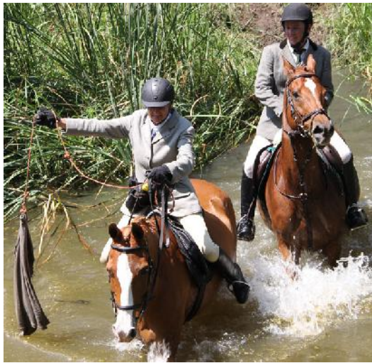
the Huntsman removes hers.

The Check is at the end of each line where riders and hounds re-group and rest before the next line. At one such check we had the opportunity to take photo's of the riders and hounds with the Land Rovers encircling.