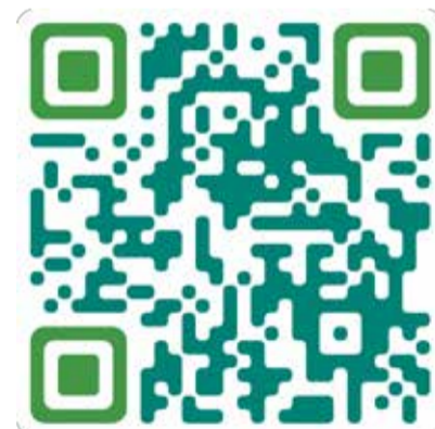
LROC WhatsApp Group