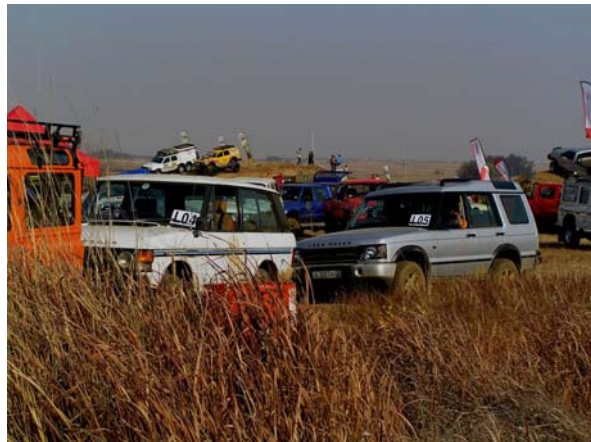
AAWDC challenge with Discoveries and Classic Range Rovers making up most of our team.